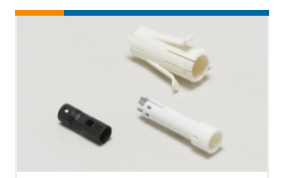
Plug & Socket Lighting Connector Accessories(57)