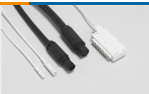
Lighting Cable Assemblies(1)